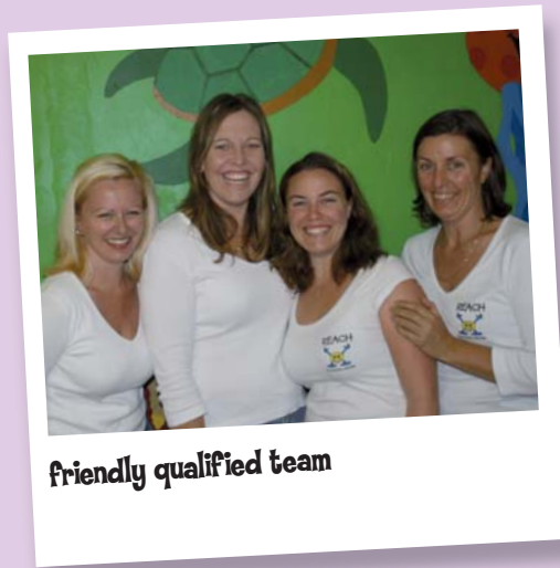
friendly qualified team